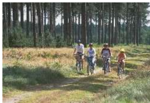
Exploring the Brecks by bike