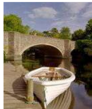
The Little Ouse at Brandon

Brandon: The Little Ouse river runs through Brandon, a bustling town that has made its livelihood from flint, fur and forestry. Collections in the Brandon Heritage Centre illustrate the town's colourful history from the Stone Age to the present. You can hire a rowing boat or take a stroll along the river. In the Market Place you'll find a market