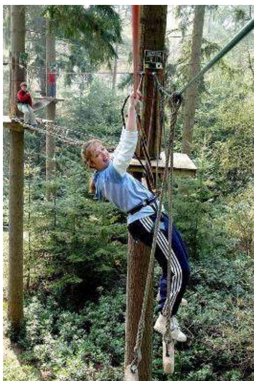
High wire forest trail at Go Ape! Thetford Forest

Cyclists have free admission to High Lodge, and there is a forest toll for motor vehicles. The Centre is the start of walking and cycling trails and it is advised that all cyclists purchase a map (priced at 50p) from the Centre before starting out on any route. Cycle hire is available at Bike Art , who can deliver bikes to your accommodation. They also sell bikes, equipment and accessories and you can also hire trailers and bikes for children.