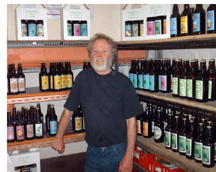
Brandon Brewing Company